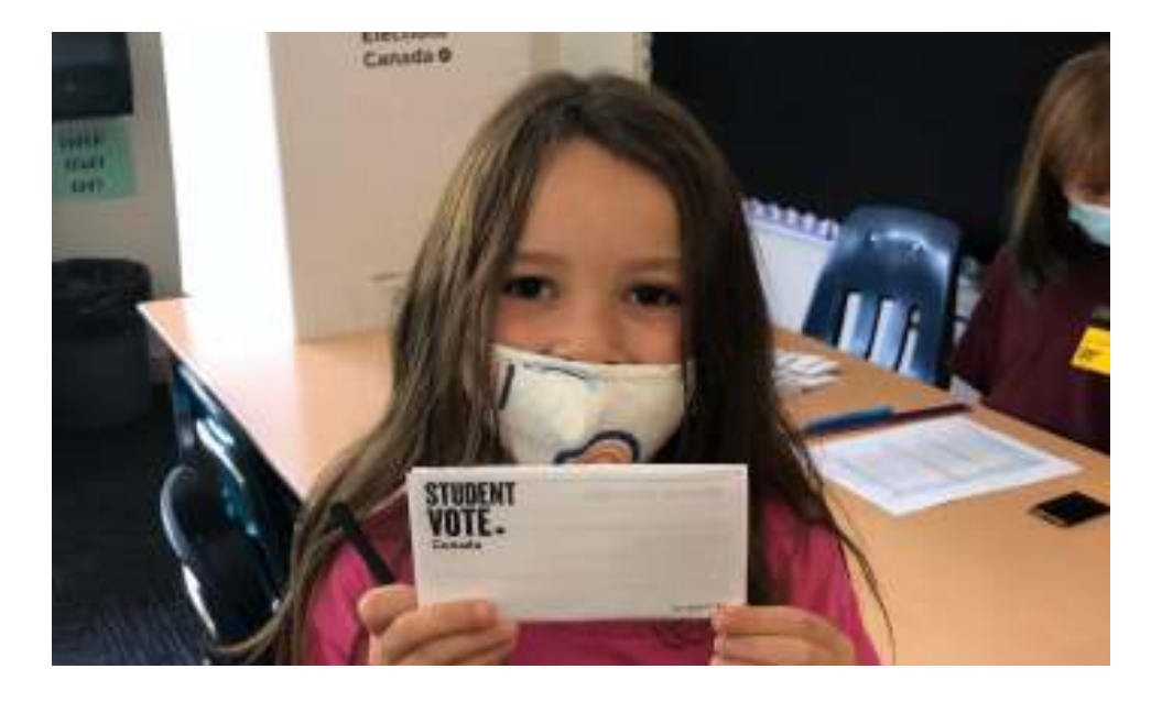
The recent 2021 Federal Election inspired the Greenwood Elementary School grade 4/5 class to participate in Student Vote by running a polling station and experiencing what it is like to cast a ballot through making an informed choice.

Additionally, families are encouraged to take part in Parent Action Committees (PAC). PAC volunteers are actively involved in fundraising and supporting initiatives that encourage student participation and learning. Field trips, resources, and supplies have been generously provided through the actions of dedicated teams of parents and families to aid classroom-based activities.