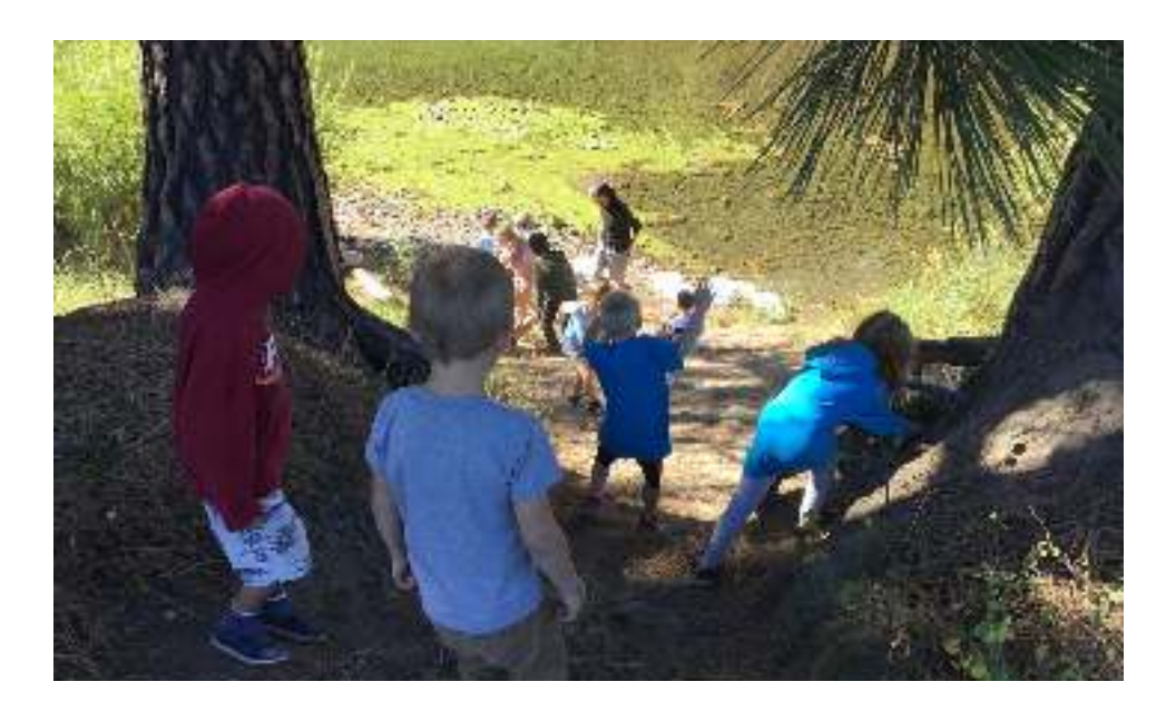
Kettle River Exploration Day, Midway Elementary School

Our values are demonstrated through T.R.A.C.K.S. which are linked to core competencies that include: thinking critically, responsibility for self, analytical & creative thinking, communication, and knowing